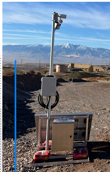
View of Deployed System