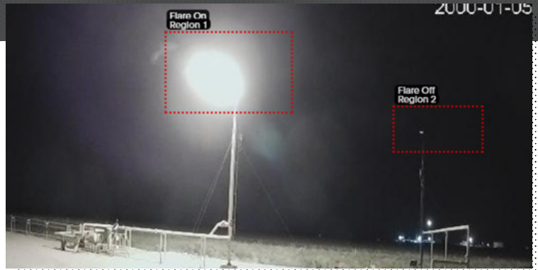
View of Deployed System

Whether addressing black smoke when it happens and adhering to EPA regulations, or knowing a pilot light is out and immediately addressing the potential gas leak, Andium gives you the visibility you need without the overhead of personnel manually driving to sites for manual, periodic checks.